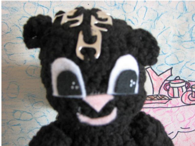
Mrs Skunk loves to have tea with Miss Porcupine