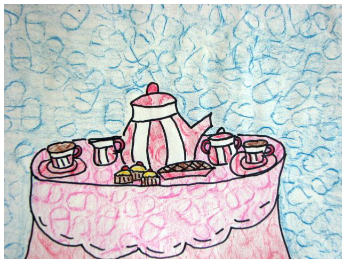
Would you like to have tea with us?