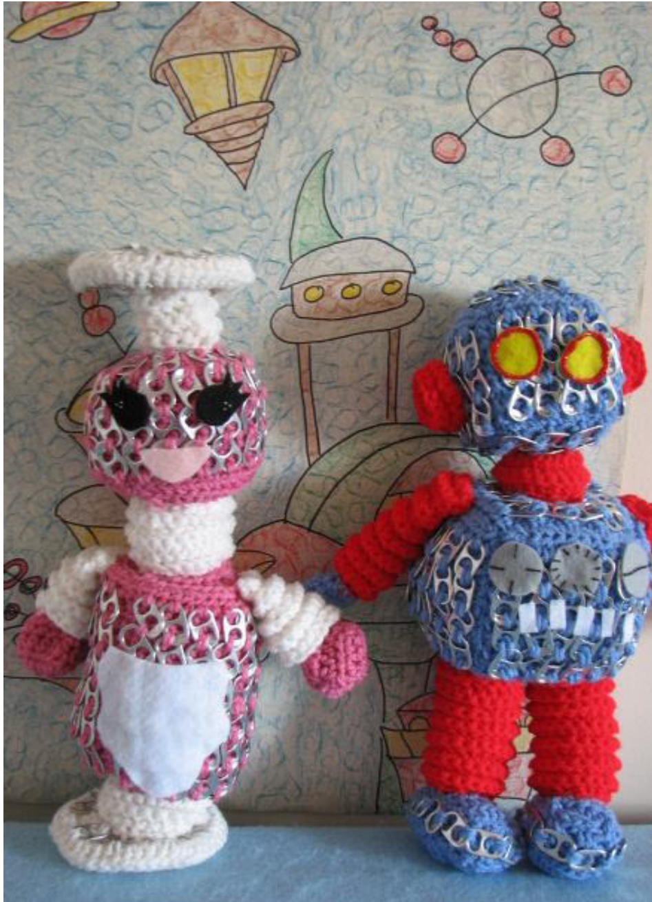
Pop Tab Robot Found His Lady Love in Mrs Robot