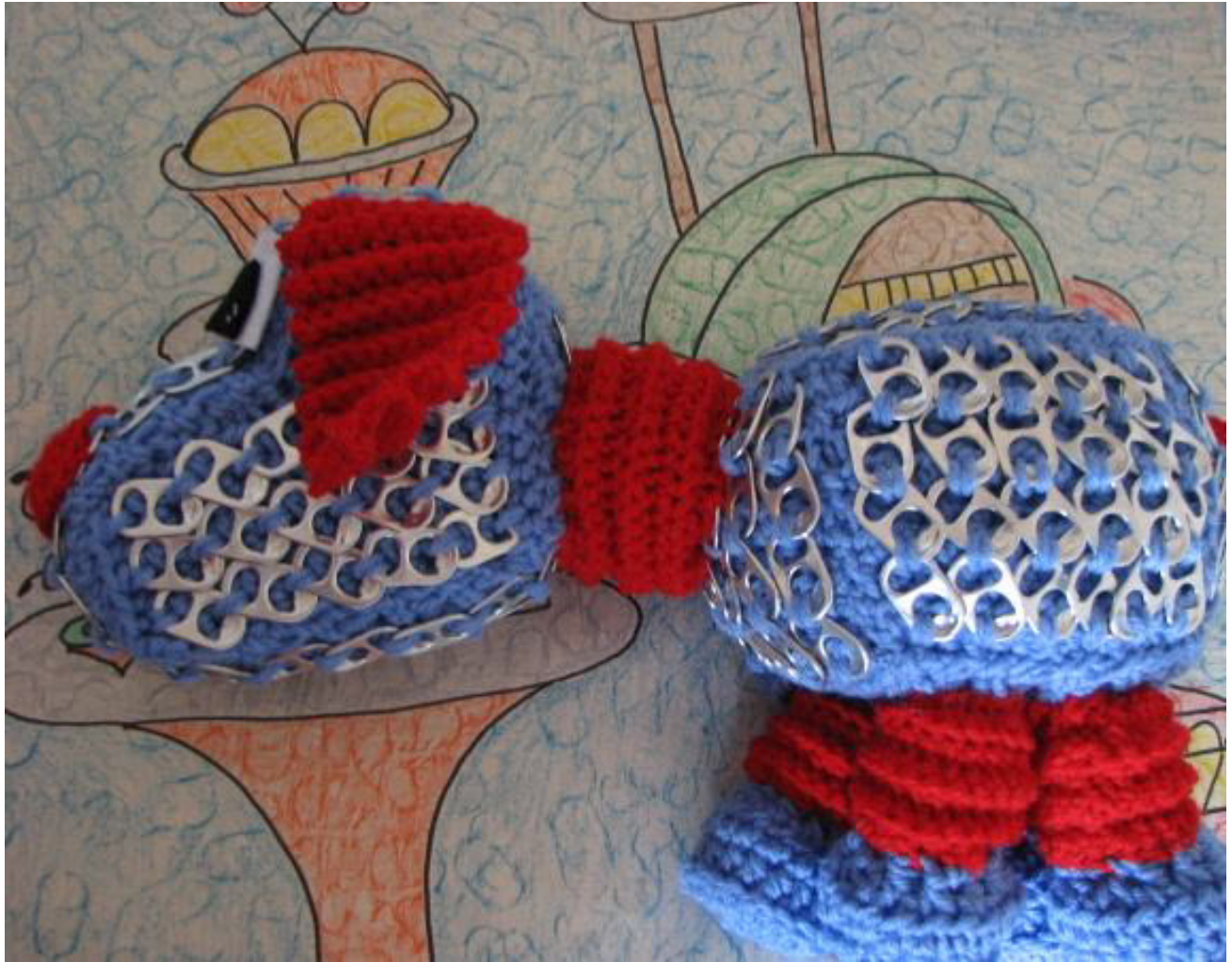
Poor Robot Dog.