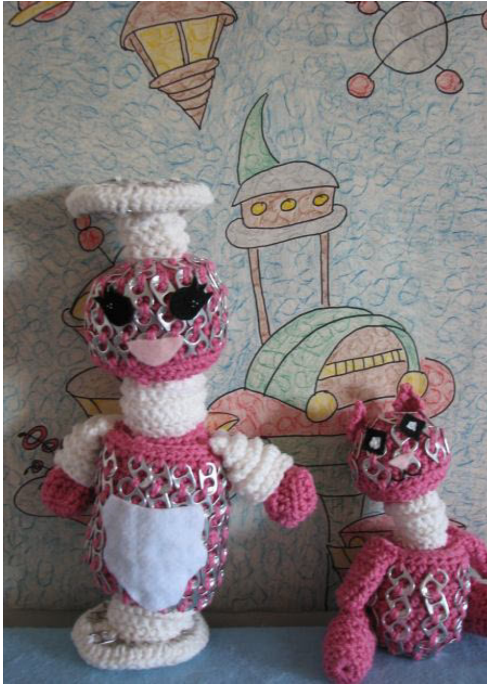
Problem Is, She Has, A Robot Kitty