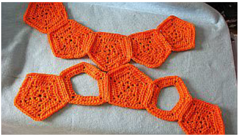
Line up the 2 curved sections as illustrated. This is how they will be sewn together.