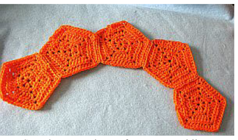
Sew them together to form a curved line.