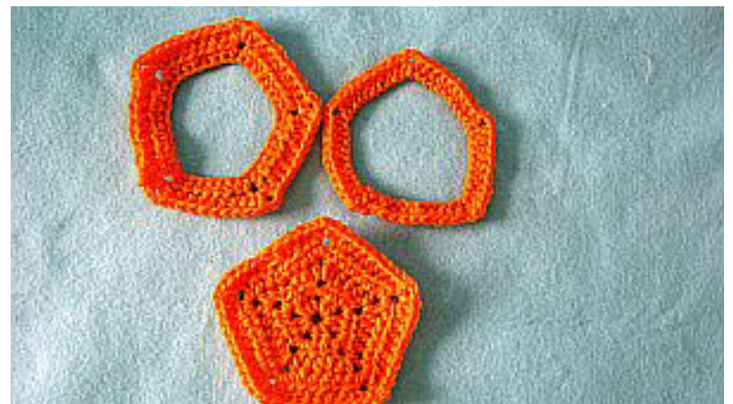
Top Left Leg Opening Block Top Right Head Opening Block Bottom Five Sided Block

With needle and yarn sew the 9 blocks, 2 leg-opening blocks and Head opening block tog to form a ball, see photo.