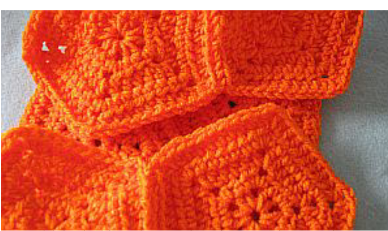
Fold in half and sew the short ends together to form a ball without a top or bottom.