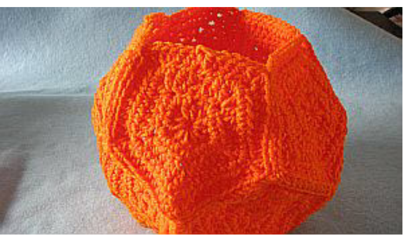
How the ball or pumpkin looks sewn together.