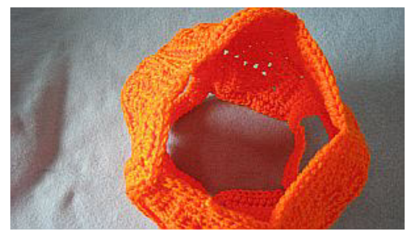
In this photo you are looking from the open (the pumpkin's bottom) part of the pumpkin inside it to the Head Opening. You will sew the last Five Sided Block here.