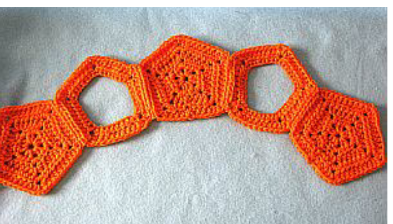
Sew them together to form a curved line.