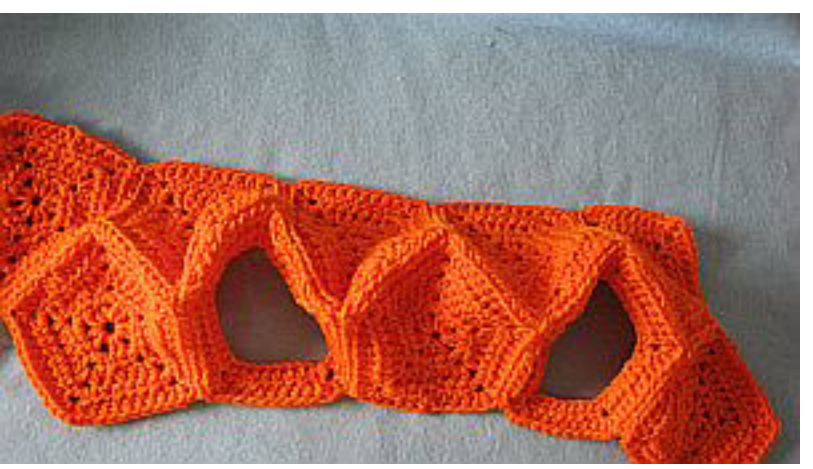
This is how they will look sewn together. Please note the 2 leg openings. The sewn together blocks will not lay flat.