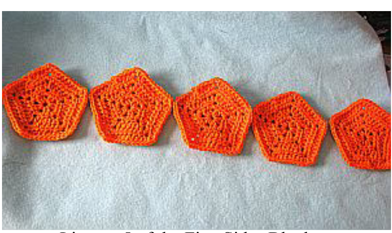
Line up 5 of the Five Sides Blocks.