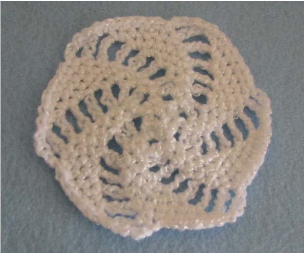
Single Motif. Note how the side is made up of a section of sc and a section of chain space.