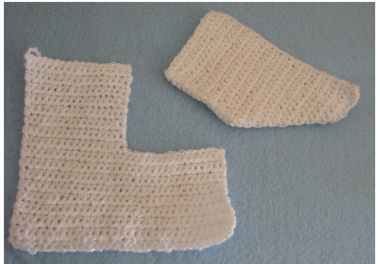
Top right is same cup folded, ready to sew.