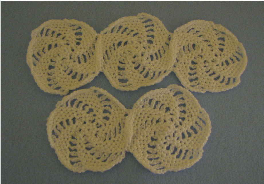
This photo show how rows go together.