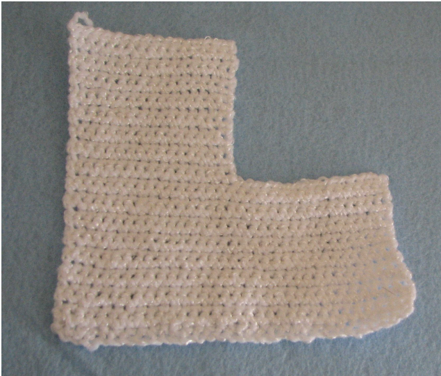
What cups looks like before it is sewn.