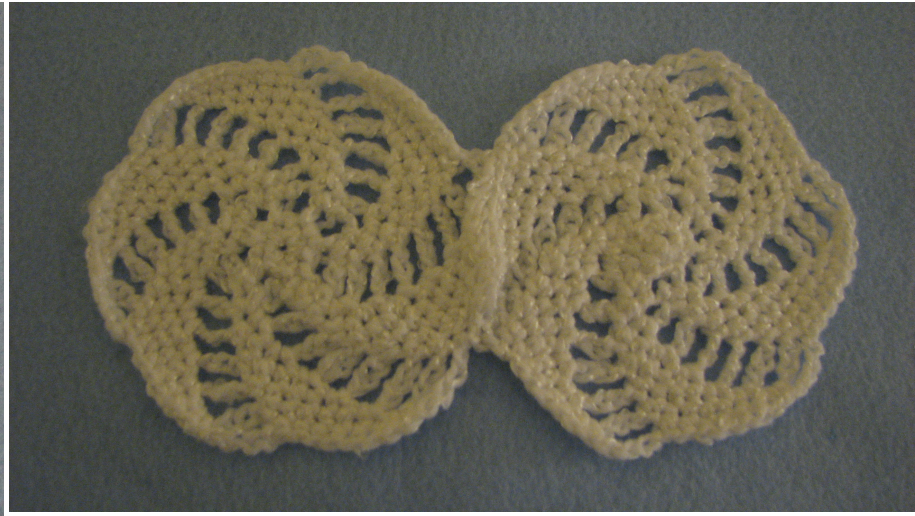
Here two motifs are sewn together side by side. Note how the chain spaces on one motif line up with the solid sc of the other and vice a versa.