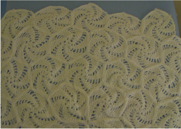
Finished section of sewn together motifs.