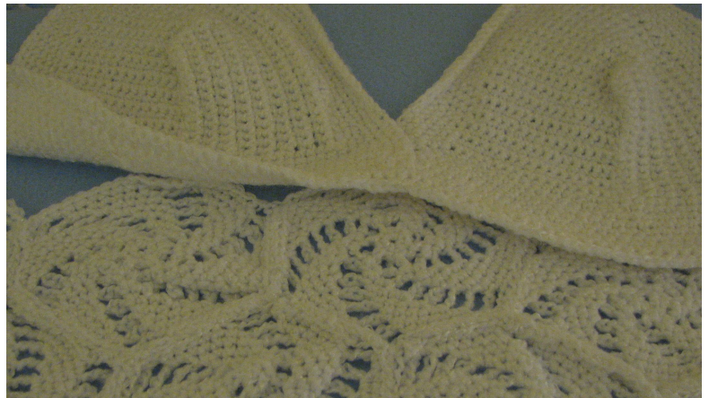
Lay the top of the halter over the uneven edges of the bottom of the halter.