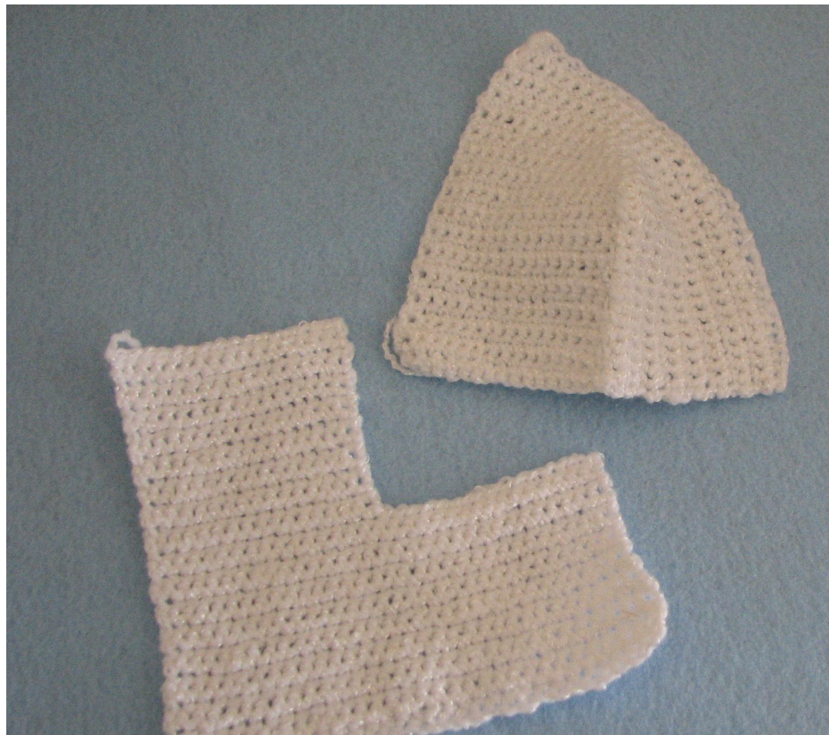
At top is the sewn together cup.